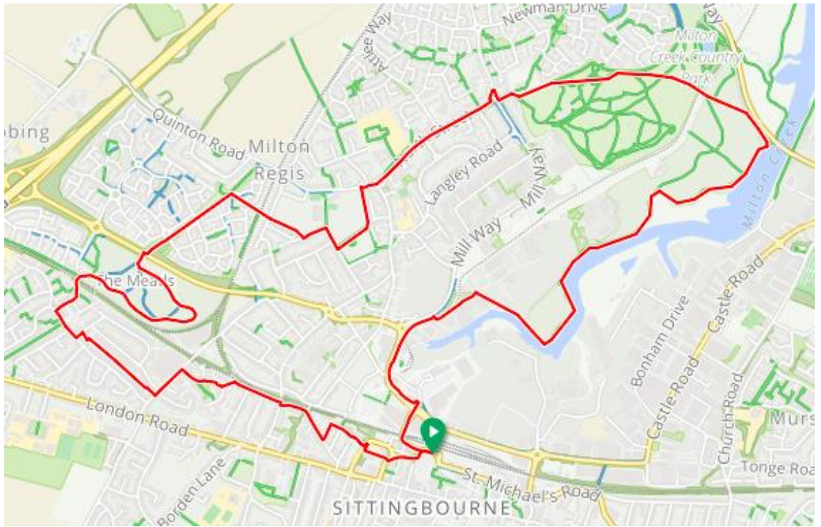
Meads & Milton Walk